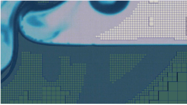
Figure 1: AMR mesh simulating an asteroid striking an ocean. Different colors of each cell indicate different materials (e.g., water or air). To accurately resolve the system state without high memory and processing overheads, xRage periodically subdivides high entropy cells (e.g., where the ocean is aerosolized) and merges low entropy cells.

of workloads, our work opens up a range of exciting new research opportunities and directions for the community. These include the design of efficient management and synchronization of telemetry data, coping with the heterogeneity of network devices, and making it fault tolerant.